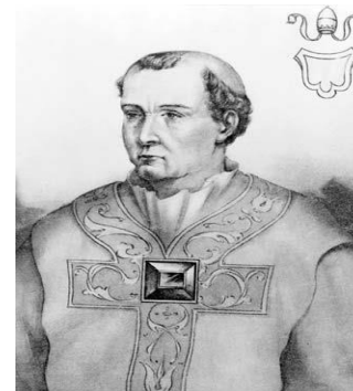
Nicholas the Great 858-867

II Timothy 4:21 - Do thy diligence to come before winter. Eubulus greeteth thee, and Pudens, and Linus , and Claudia, and all the brethren.