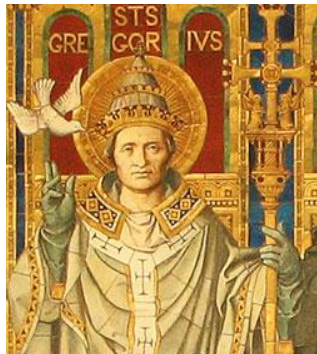
Gregory the Great 590-604