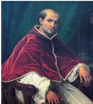
Clement V 1305-1314

Micah 3:11 - The heads thereof judge for reward, and the priests thereof teach for hire, and the prophets thereof divine for money: yet will they lean upon the Lord, and say, Is not the Lord among us? none evil can come upon us.