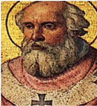
Leo IX 1049-1054