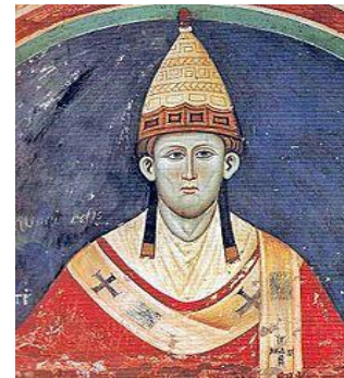
Innocent III 1198-1216

Acts 8:18 - And when Simon saw that through laying on of the apostles' hands the Holy Ghost was given, he offered them money, ...