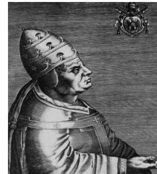
Urban VI 1378-1389

Micah 3:11 - The heads thereof judge for reward, and the priests thereof teach for hire, and the prophets thereof divine for money: yet will they lean upon the Lord, and say, Is not the Lord among us? none evil can come upon us.